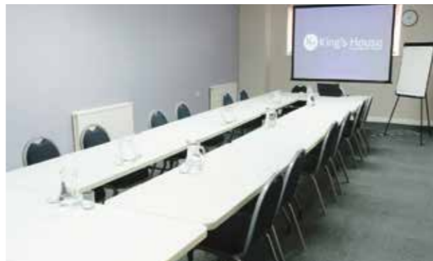
Seminar Room 5

Each room is equipped with a projector screen and suspended LCD projector and has natural daylight and air conditioning.